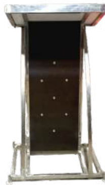
Stainless Steel Podium