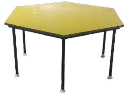
Kids Hexagonal Table